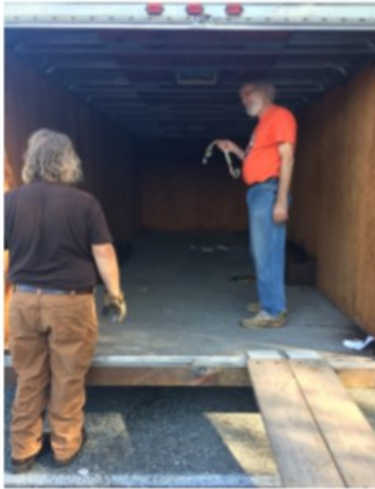
Do we need this?