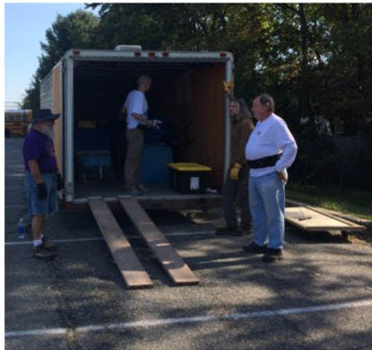
Unloading the old trailer