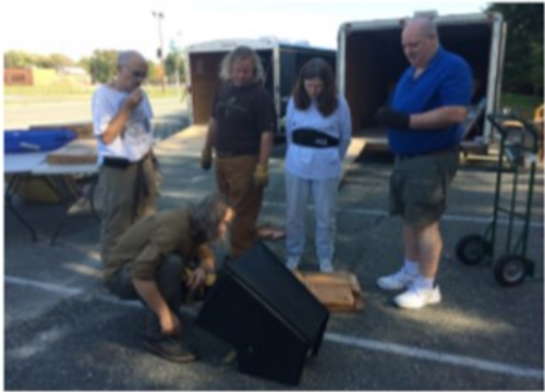
What is this? And why was it in the trailer?