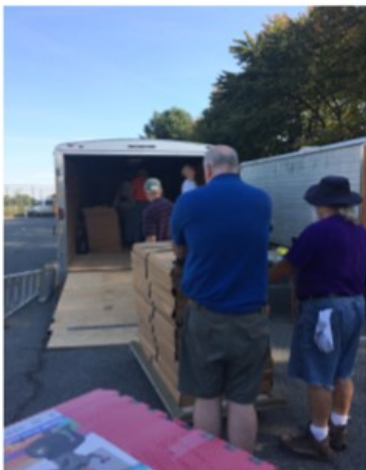
Loading the show cases