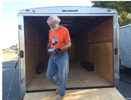
Making sure everything is in order