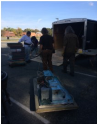
In goes the shop!